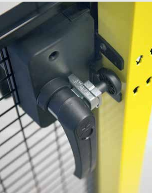
Back side hitch lock, adjustable handle included